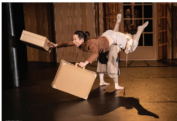
Pop Up!, 2021 Next page: Citizen Puppet, 2015